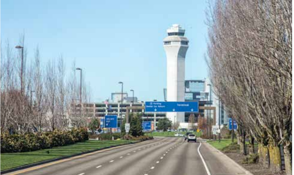
▲ Portland International Airport