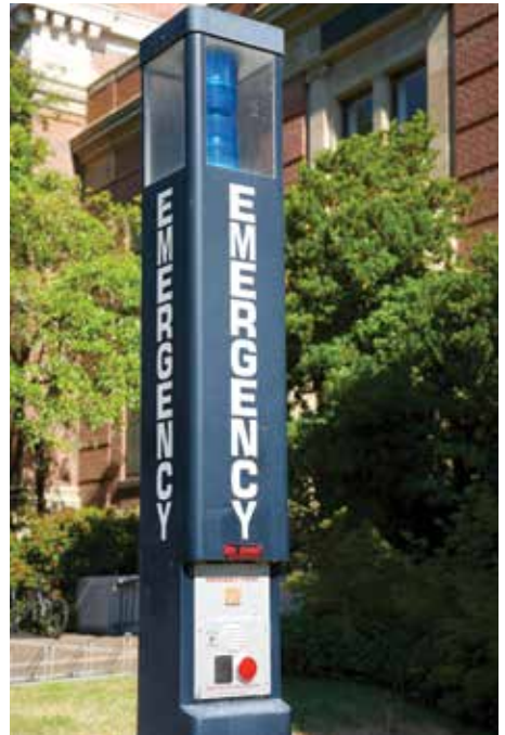
▲ Blue Light Emergency Phone