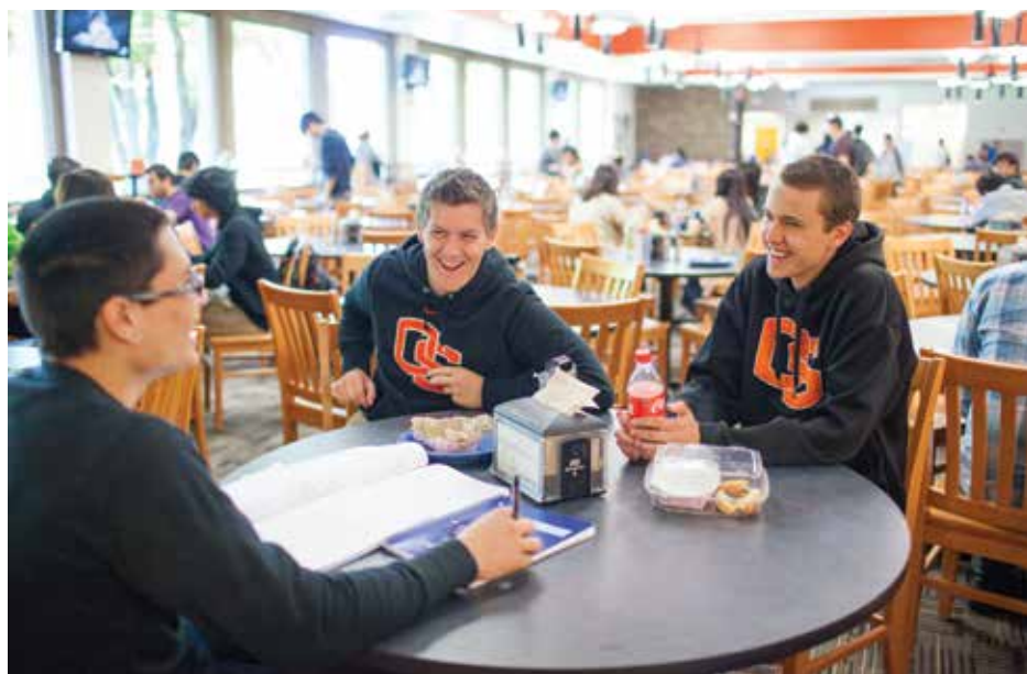
▲ Students enjoy lunch at the dining center.

For details on any information provided here, please contact: into.housing@oregonstate.edu