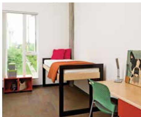
▲ Sample bedroom