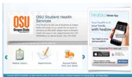
▲ OSU Student Health Services Patient Portal

The OSU Student Health Insurance Plan includes coverage for travel periods 5 days before and after the study plan start and end dates. Students may purchase additional travel insurance if desired, but travel insurance plans