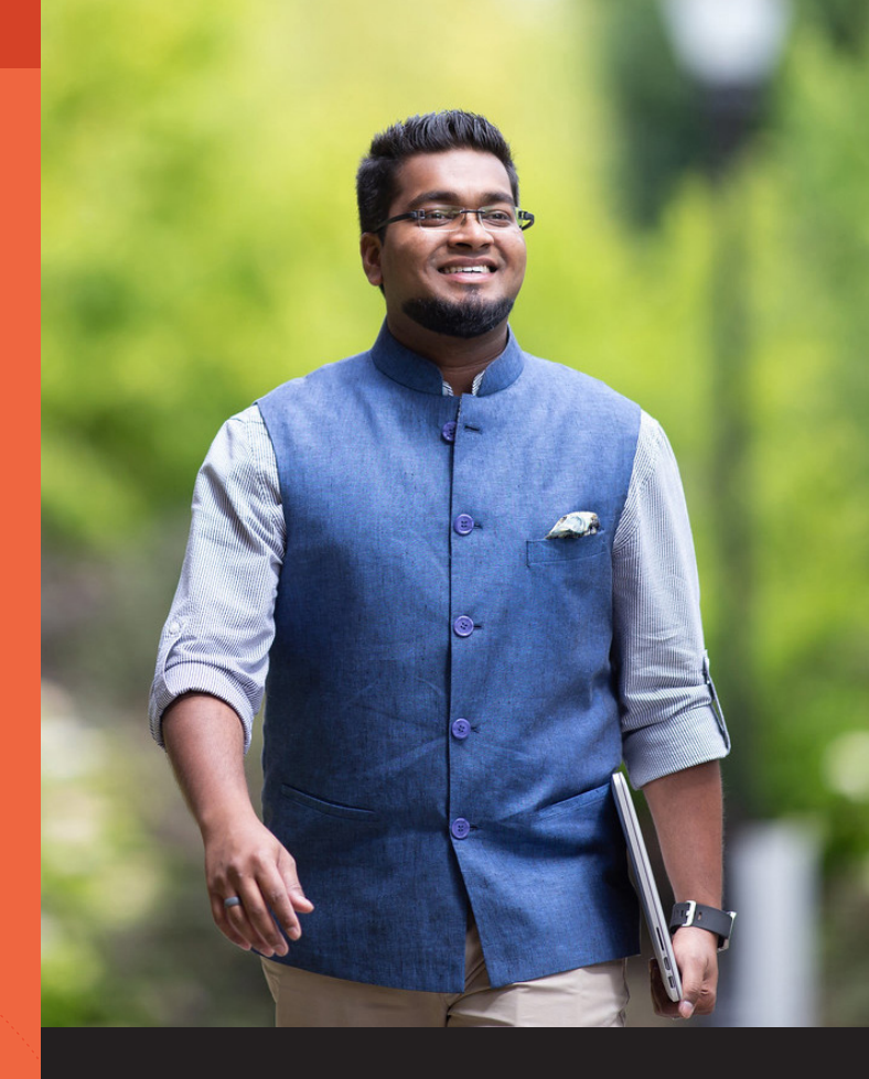
Earn up to $20,000+ per year working on campus