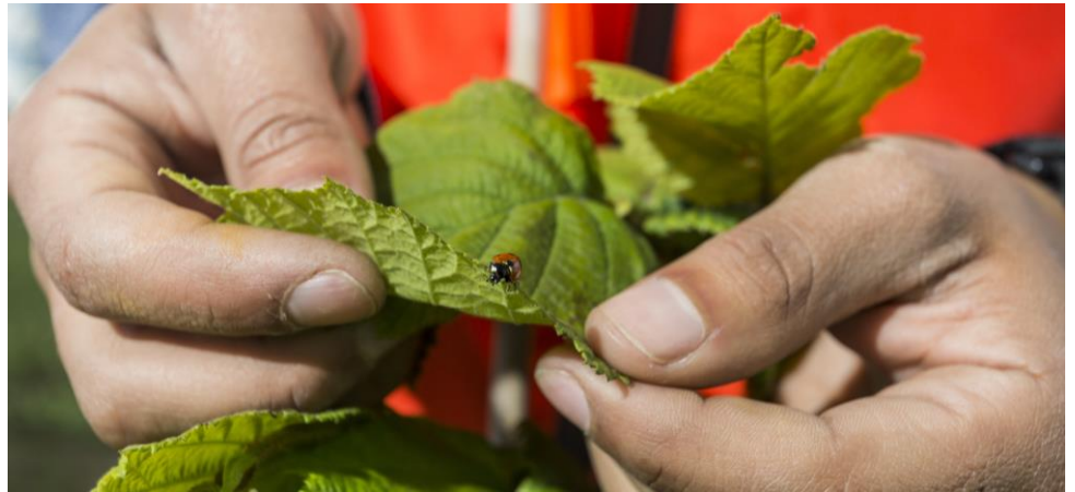
Oregon is well-known for it's fresh and locally-grown produce

Leisure is a revealed preference of what we love! How we spend our valuable free time shows what our interests are! Knowing what your partner(s) likes to do, to learn, to see, and/or to explore will help the conversation flow better focus suggestions or ideas you can give them!