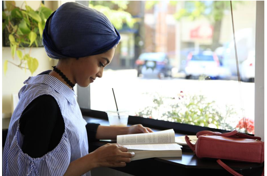
Treat yourself to a local coffee in Corvallis

In a time where life can feel more stressful than normal, how are you and your partner staying calm and centered? What can you recommend each other? This is a great opportunity to explore cultural expectations of self-care and share opportunities within OSU and Corvallis!